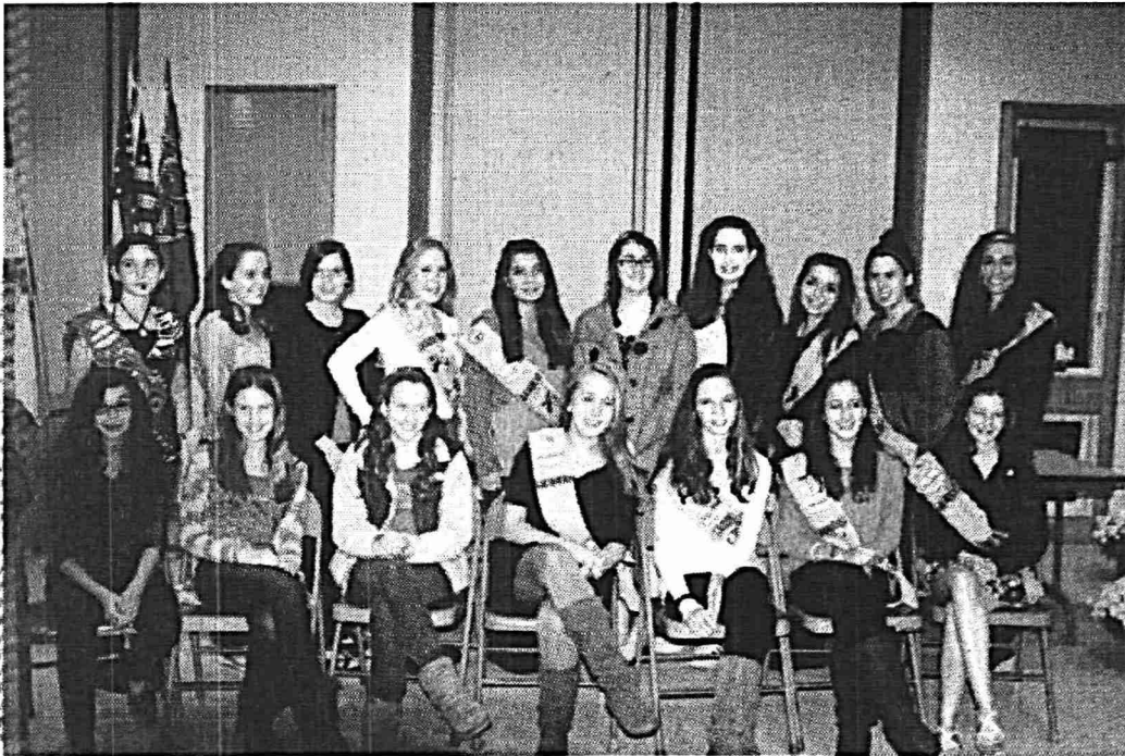
The Older Girl Scout Court of Awards celebrated troop activities and Council-level recognitions.